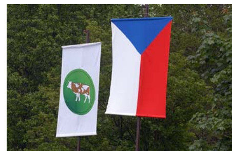
From the WSFF Council Meeting 2007 Czech Republic

284 days only and Simmental-Fleckvieh enthusiast from all over the world will meet in UK. More details follow: http://www.britishsimmental.co.uk/congress2008/index.html