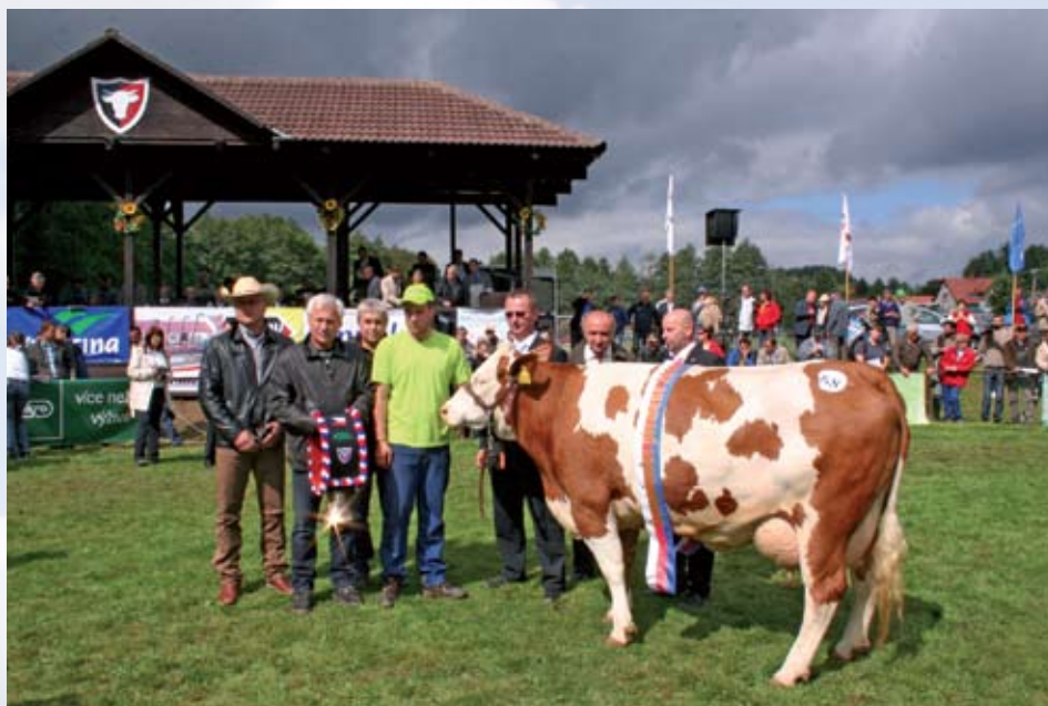
The champion cow No CZ 170 508 953, father: ROIBOS, breeder: Agro Liboměřice, a.s. (2nd max. lactation: 10 069 - 3,61 - 363 - 3,14 - 316)

The following day there was the 10 th Anniversary Czech National Fleckvieh show in Radesinska Svatka, a small town in the central region of the Czech Republic. Some 6000 school children and adults viewed the display of 150 head of Simmental/Fleckvieh cattle.