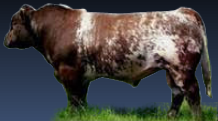
Polled Durhams 1889