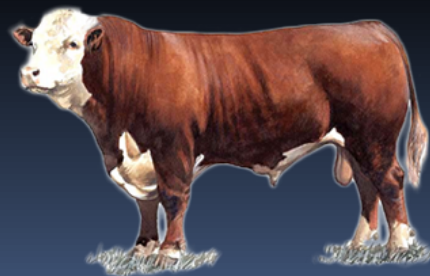
Polled Hereford 1926