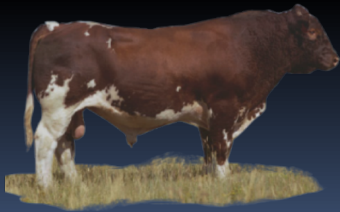
Maine Anjou 1969