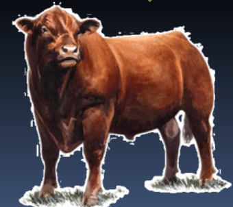
Red Angus 1954